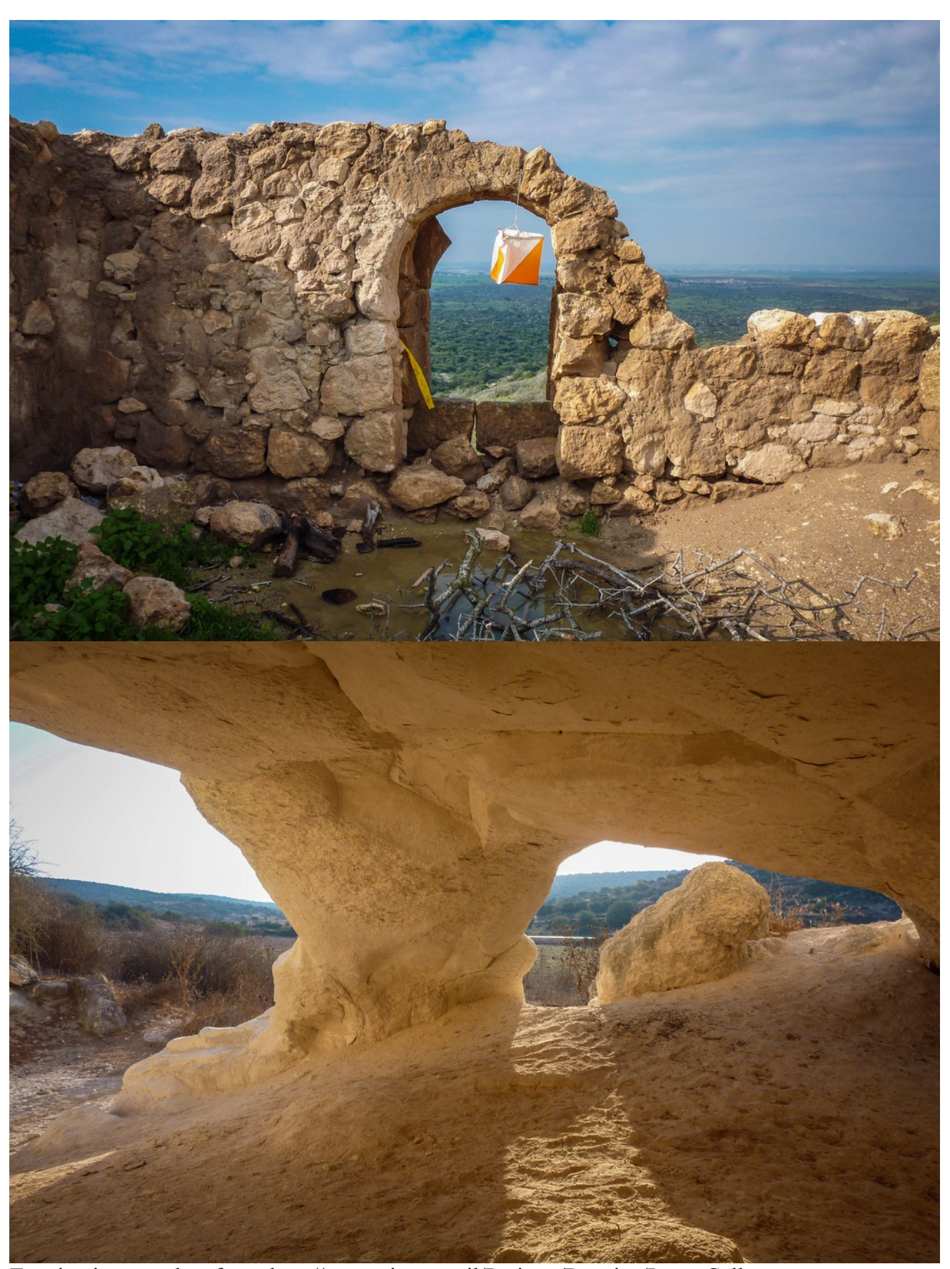
Terrain pictures